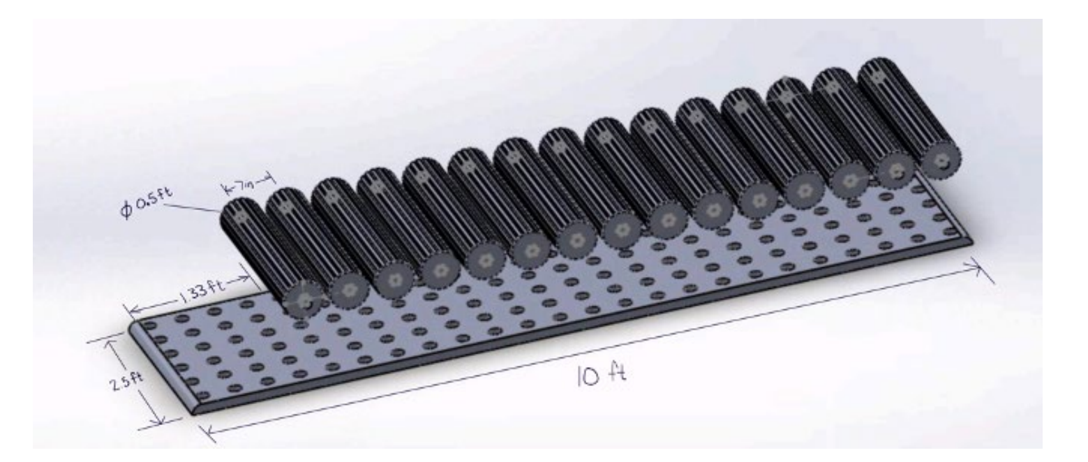
Figure 4 - Solidworks drawing of modified press system

The current process consists of a 6 ft long vibratory conveyor and a 4 ft long press conveyor, with one 6 in diameter roller. Prior to the press conveyer, the corned beef is removed from the production line, and stacked in vats for 3 min. The corned beef is placed back on the production line and run through the press conveyor. The goal of this design is to equate the pressure exerted on the meat in the vats to the pressure exerted on the meat by the press conveyor. To account for both the pressure and the time element, elongation of the press conveyor would result in consistent purge reduction in every product, as well as make the IC process fully continuous.