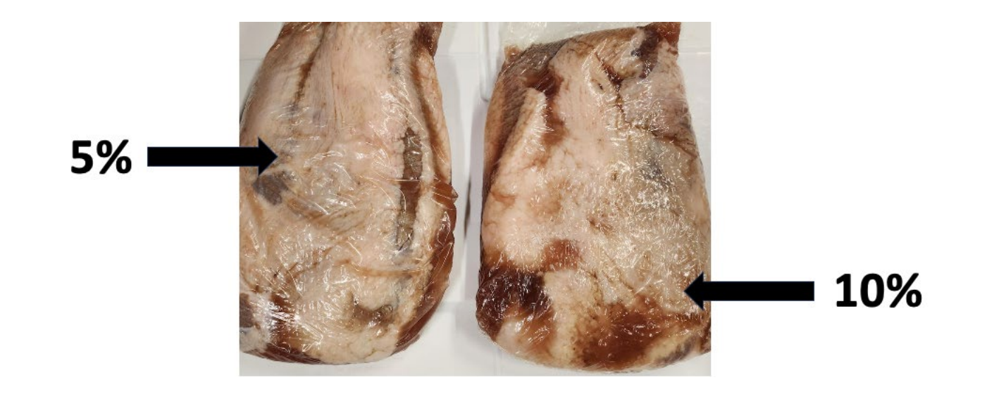
Figure 1 – Ideal and unideal purge amounts in packaged corned beef

Purge is the reddish-colored liquid that accumulates at the bottom of the packaged meat product and is commonly mistaken by consumers for blood. Purge can be unappealing to the consumer and decrease customer perception of the product. Purge is a byproduct of the brine injected into beef and natural post-mortem muscle changes. Brine is a solution that infuses proteins, salts, and sugars into the beef to improve the flavor and tenderness of the meat. The proteins in the meat are unable to hold onto all the brine injected during processing and cutting. Therefore, purge is moisture that gradually seeps out of the brisket, as the brisket cells loosen when the product sits out. (U.S. Department of Agriculture [USDA], 2013).